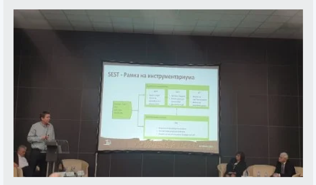
TUdi presents decision support tools at agricultural conference in Bulgaria

The workshops for Early Career Researchers was the first of a series of online workshops on soil health featuring European and Chinese project partners. The event, organised by TUdi, supported the knowledge that is exchanged and cooperated between Europe and China.